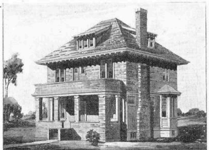
Size 34 feet by 30 feet; Studding 18 feet high See Our FREE PLAN OFFER on Page One

Read about the construction of Our Houses on Page 26.